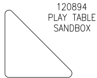
120894 PLAY TABLE SANDBOX